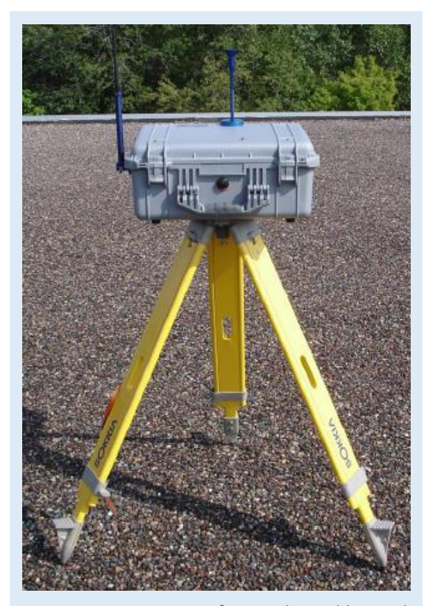
Stationary monitors are frequently used by rural communities to monitor dust.