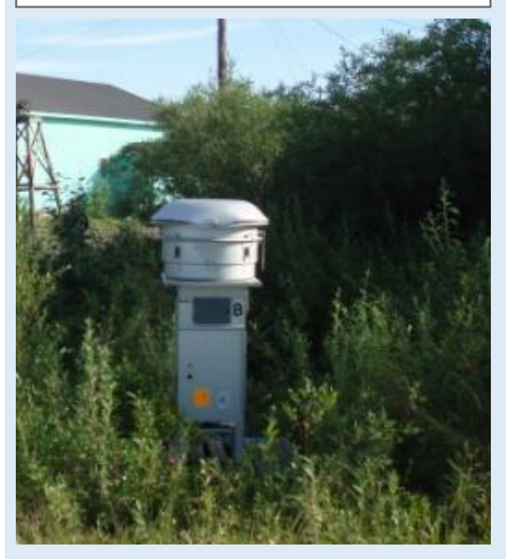
Stationary air monitors can be placed alongside unpaved roads in communities near a reliable power source and frequently-used routes where the most individuals are expected to be exposed to dust.