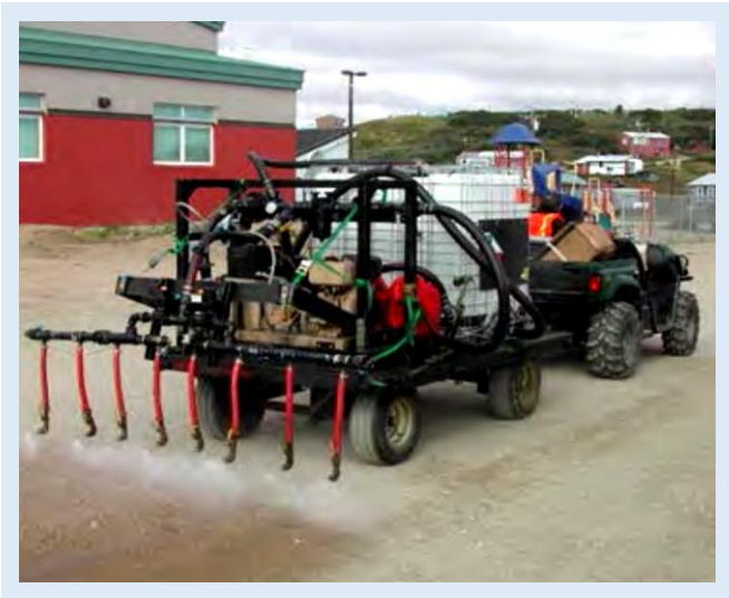
Portable applicators for spraying dust suppressants can be easily flown to rural Alaska on a small aircraft. The system can be mounted to a trailer and pulled by an ATV.

Salt-based suppressants work by absorbing moisture from the air to bind dust particles together or onto larger particles. To remain effective, salt-based suppressants need at least 30% relative humidity. Calcium chloride and magnesium chloride are the most common types of salt-based suppressants. Wet weather may wash away salt-based suppressants, so it is imperative to avoid application before rainy conditions. Salt-based suppressants may cause roadside subsistence foods or fish racks to have a bitter taste. Salt-based suppressants can be applied as a liquid or a solid. Generally, one or two treatments are required per season.