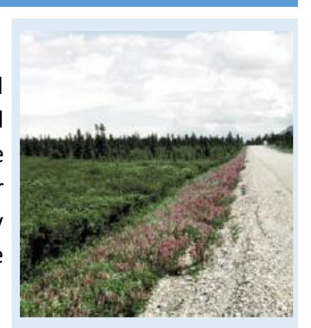
Vegetation along the road helps prevent erosion and dust. (Photo of a road in Denali National Park following road maintenance)

Vegetation along roads reduces dust by acting as a physical barrier between the road and community. Vegetation binds, covers, and stabilizes the soil along the road, further reducing erosion and dust. Soil needs to be conditioned for vegetation to grow readily.