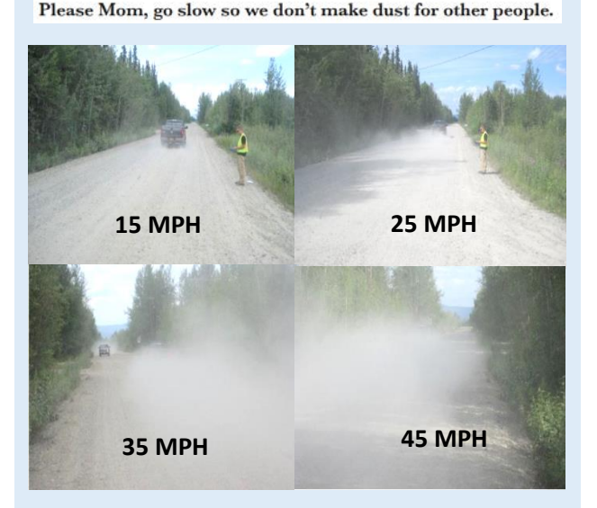
Dust can be dramatically decreased by reducing speeds.