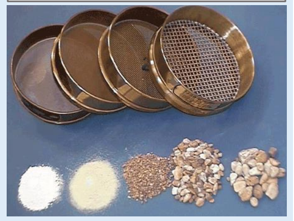
Sieved gravel showing various sizes of material. An aggregate gradation is mostly composed of gravel, sand, and silt. (Photo from ADOT&PF presentation, "Alaska Gravel Road Problems.") http://cem.uaf.edu/media/188432/gravelroads-lecture_mchattie_june-2015.pdf

by having sufficient drainage to allow water to flow to adjacent ditches. Ditches must be kept clean of vegetation and accumulated sediment to allow roadway water to run off. Roadside vegetation cover helps reduce dust and erosion.